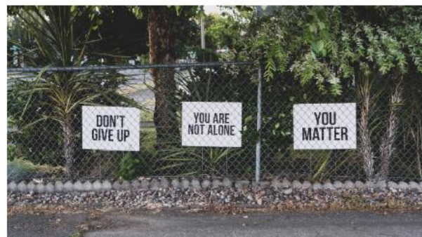
Candlelight Community Centre – Stocksbridge High School, Sheffield

“Social Innovation Education is a collaborative and collective learning process to build competencies and social relationships and take innovative action for a more democratic and sustainable society”.