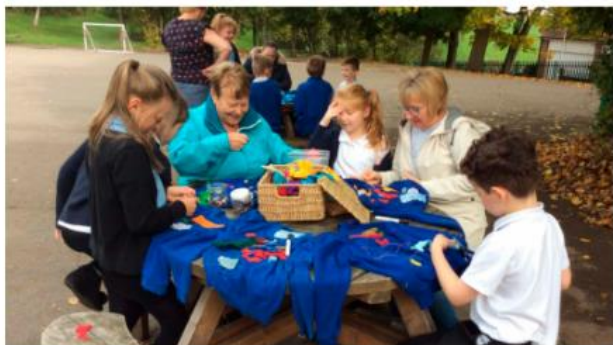
Forever Fashion – Roughwood Primary School